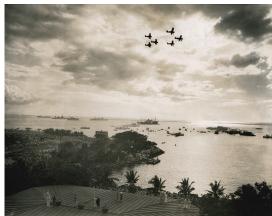
The Martin M-130 China Clipper in Manila Bay 1935 photograph