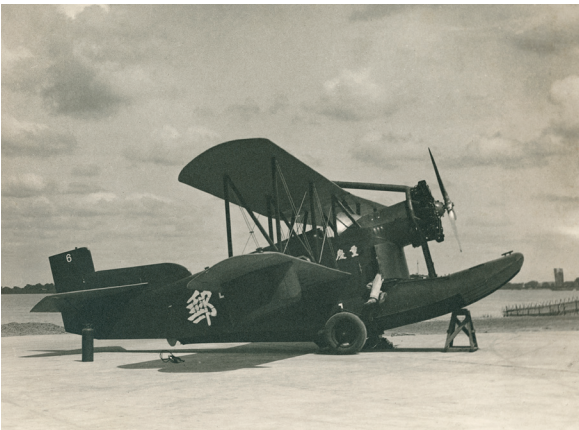
CNAC Loening Amphibian #6 1930s photograph 2019.121.0098 R2023.1501.009