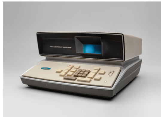
Friden electronic calculator model 132 c. 1965 Friden Calculating Machine Company, Inc. San Leandro, California L2021.0902.011