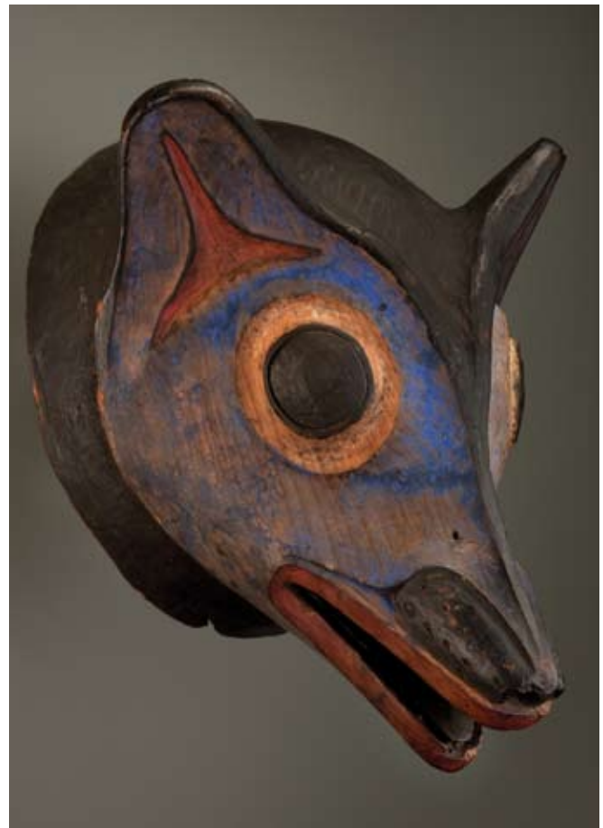
Mask early 1900s Tlingit Northwest Coast wood, pigments 2-4771; L2010.1801.006

include numerous costumed performers dancing and performing symbolic gestures while being accompanied by musical instruments such as flutes, rattles, drums, and chorus singers. When not in use, masks were carefully stored until the next performance.