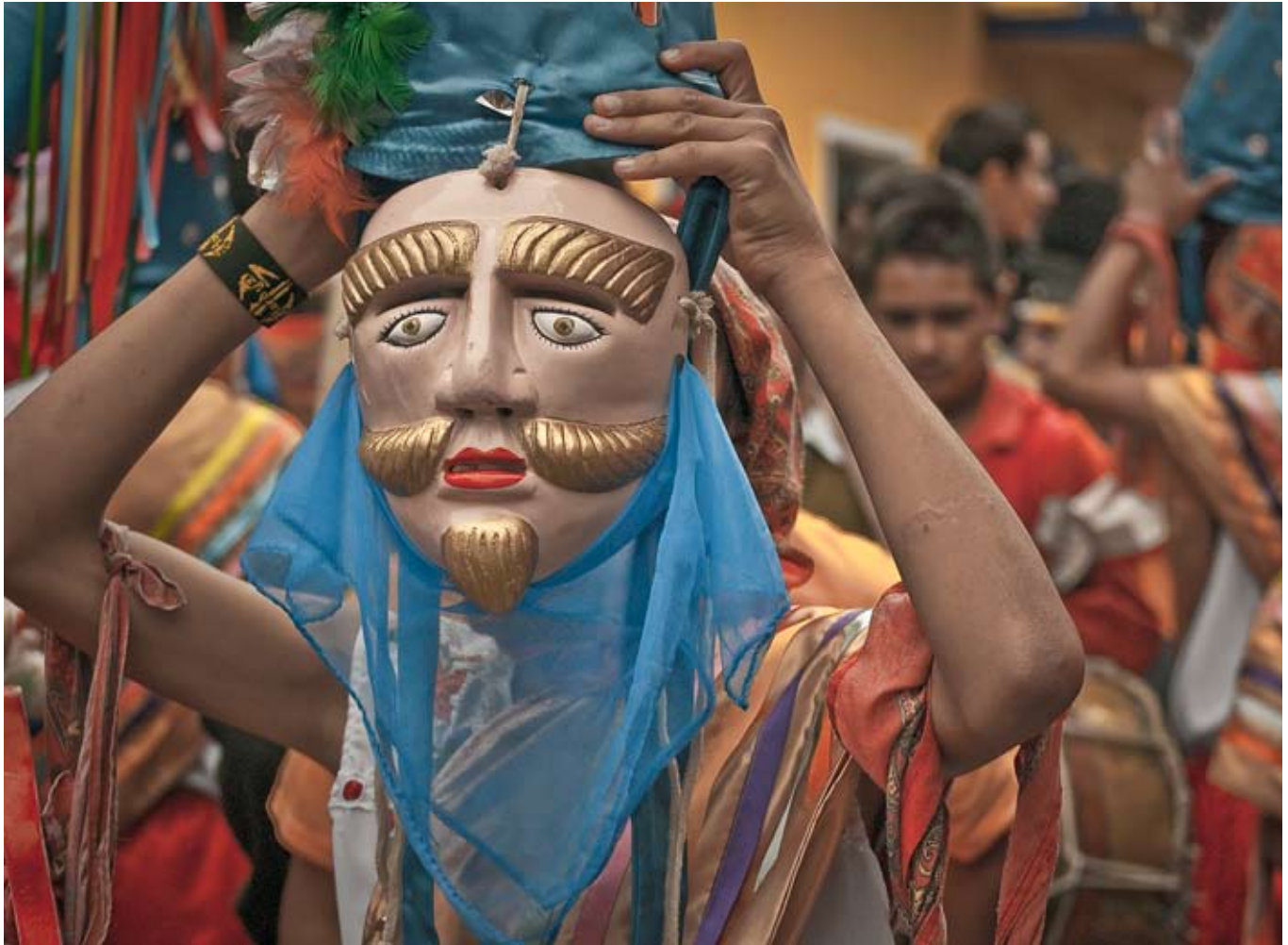
Dance of the Moors and Christians; Naolinco town, Veracruz, Mexico, 2009.

Masks are perhaps the most elaborate of the ceremonial arts in Mexico. Indigenous traditions of masking were overlaid with Catholic influences brought by the Spanish. Today, masks are found primarily in the southern, central, and northwestern states of Mexico, areas containing substantial Indian populations.