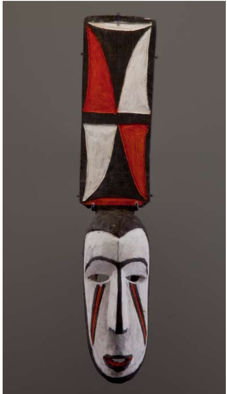
Mba mask 1959–60

In contrast, njenji , performed during the dry season festival, is a parade made up of young men. The masked performers walk in a line, arranged in order of descending age. The men are organized by the type of mask that they wear. Many performers are dressed in costumes that make them appear as females. Some walk side-by-side as couples, dressed as a man and wife, sometimes in European dress. Other maskers are dressed as scholars or priests. Masked singers are the only musical accompaniment to the parade.