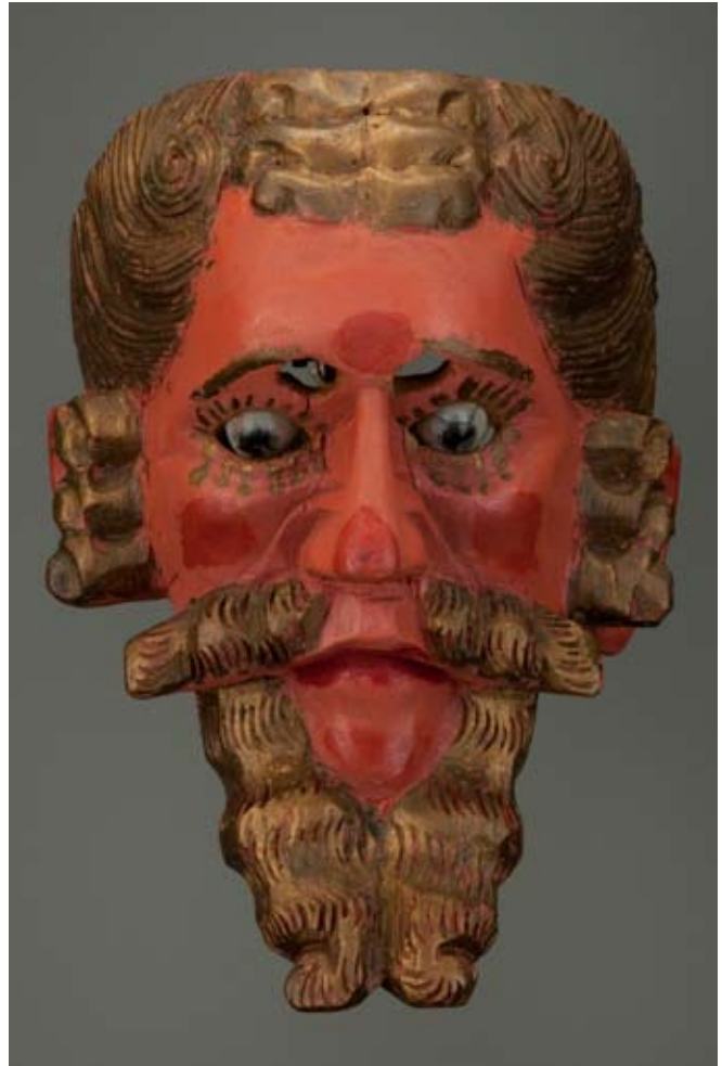
Alvarado mask before 1950

Mask and costume rental businesses, known as morerias , have existed in Guatemala for at least the past two hundred years. These family-run shops range in size from small single rooms to multiple rooms with several thousand square feet. In most morerias , the rooms of the shop are covered floor to ceiling with masks and costumes, which are organized by type. Performers borrow all manner of costumes for various festivals and masquerades.