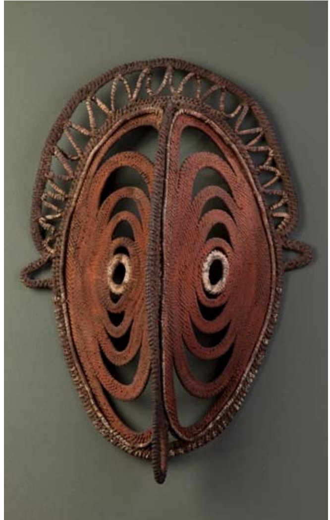
Yam mask probably 1900–60 probably Abelam New Guinea, Melanesia plant fibers, pigments 11-42928; L2010.1801.101

Men weave yam masks. A skilled weaver produces masks that are tightly woven with easily recognizable characteristics that clearly convey the spirit of the ancestor. Paint, dyes, and clay pigments provide the finishing touches and transform the masks from an inanimate object to a living ancestor spirit. Masks are typically cleaned and recolored after each ceremony.