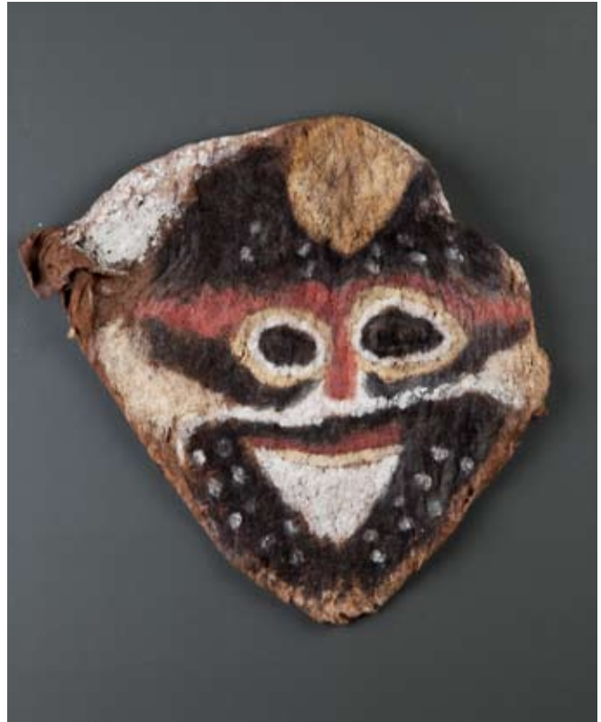
Mask before 1969 New Britain, Melanesia bark cloth, pigments 11-40746; L2010.1801.094

The people of Melanesia have produced a remarkable variety of masks in a wide range of styles and sizes. Historically, masked performances portrayed important ancestors, spirits, and other supernatural beings. The entire community could view certain masks, while others were seen only by initiated men. Masked ancestral spirits were invoked during masquerades performed for important occasions, such as the building of a ceremonial house, construction of a ceremonial canoe, or the initiation of young men into secret societies. Masquerades were performed for young male initiates to explain history, mythology, and important aspects of religion. Masked performances also took place throughout the year for the education and entertainment of the entire village. Masks representing ancestral spirits were responsible for promoting the success of important activities such as agriculture, hunting, fishing, and warfare in addition to funerary, fertility, birth, and name-giving ceremonies.