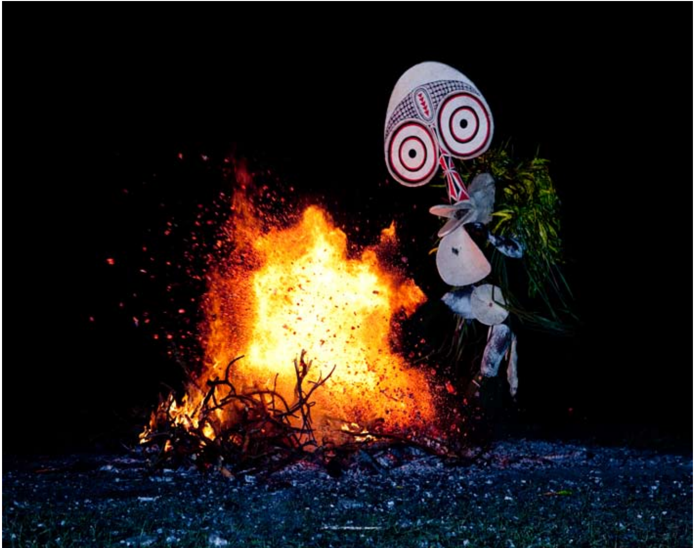
Baining fire dance ; New Britain , Papua New Guinea, 2009.

The Baining people use these masks in a night dance, also referred to as the snake dance. In spectacular performances, men bravely dance around and through a fire in cleared village dance grounds. Night dances were originally concerned with male