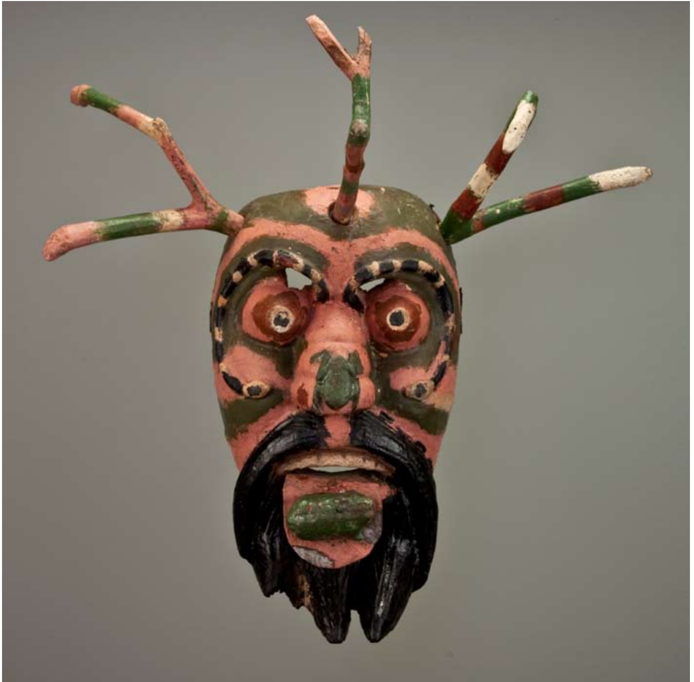
Devil mask before 1950 Coban, Guatemala wood, paint 3-15574; L2010.1801.032a-d