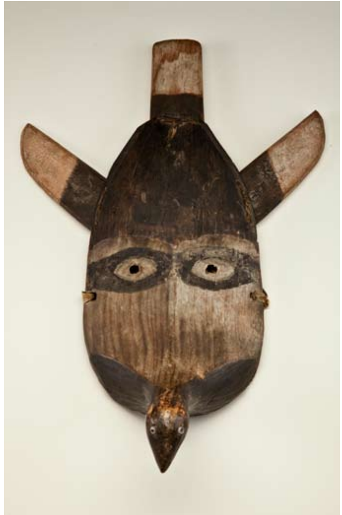
Mask before 1898

Many masked performances took place inside the communal men's house during festivals. Ceremonies focused on the interactions between humans, animals, and the spirit world. People used masks during the midwinter dance ceremony or Agayuyaraq , to honor, influence, and feed the spirits of game animals, thus ensuring successful hunting in the year to come. Most masks were destroyed soon after their dance presentation by burning or leaving them on the tundra to decay. In some areas, people hung masks from trees to rot.