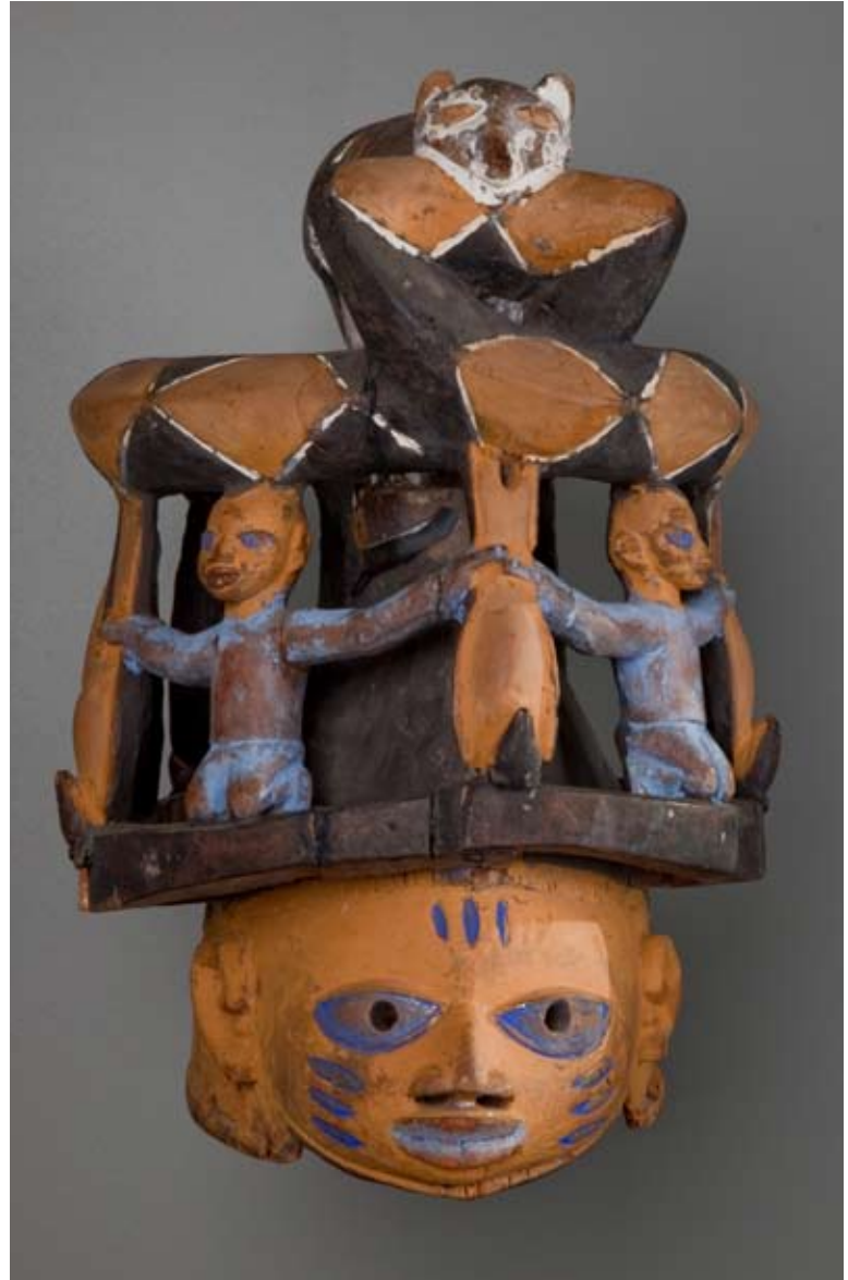
Gelede mask c.1930–40

A variety of masquerades aid Yoruba communities in communicating with the spirit world, while entertaining the living. Gelede festivals celebrate women and motherhood. These festivals are meant to honor the power and authority of females and ensure fertility. Gelede performances take place each year at the beginning of the agricultural season. Men play the role of women, wearing elaborate costumes and masks similar to those of an Egungun masquerade, which honors ancestors. The Gelede festival entails a sequence of dances, which begin with a series of nighttime performances and rituals known as Efe. On the day of the Gelede performance, a number of masquerades take place, which are performed in order of age, the youngest appearing first. Egungun and other Yoruba maskers hide their identities and speak in disguised voices. The Gelede masker, however, may unmask in public and speaks in a natural voice.