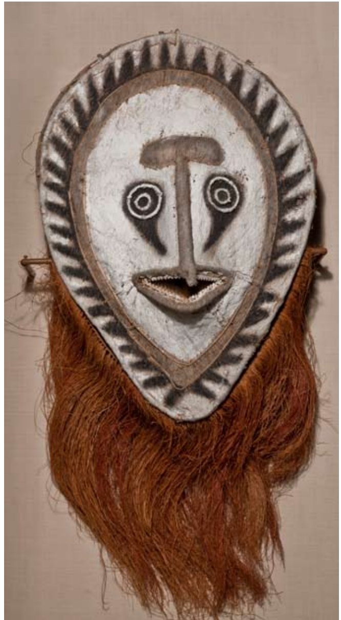
Mask before 1960 probably Elema people Orokolo Village, New Guinea, Melanesia bark cloth, pigments, lime, fiber 11-37414; L2010.1801.097

The Elema people of the Papuan Gulf region of New Guinea once participated in a cycle of masked rituals that revered water spirits known as ma hevehe . The most significant mask used in this ritual was the enormous mask known as the hevehe . Counterbalancing this sacred mask was the eharo , literally “dance head” or “dance mask,” a brightly painted oval-shaped mask made from bark cloth stretched over a framework of cane. These masks, though part of an important ceremonial cycle, served the purpose of entertaining spectators. Most eharo depicted aulari —the ancestral spirits associated with individual familial clans. Other eharo portrayed spirits and characters inspired by local oral tradition.